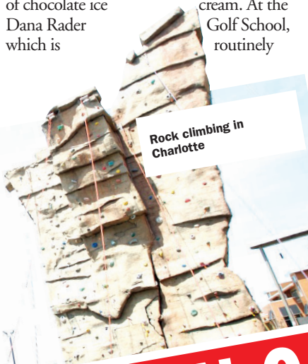
Rock climbing in Charlotte