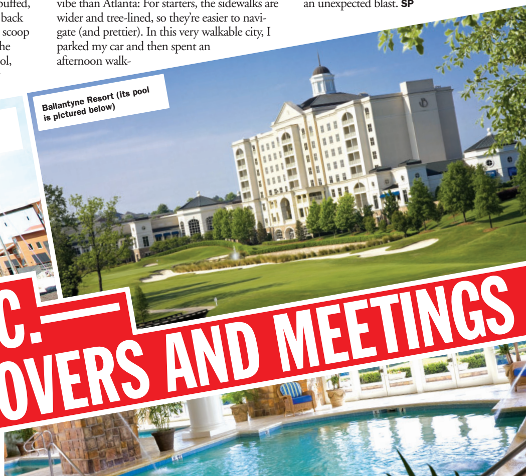
Ballantyne Resort (its pool is pictured below)