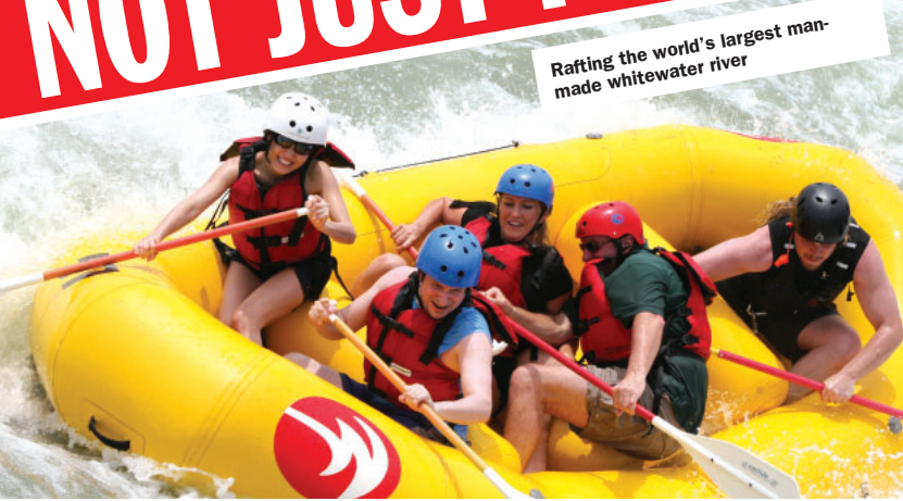
Rafting the world's largest man-made whitewater river