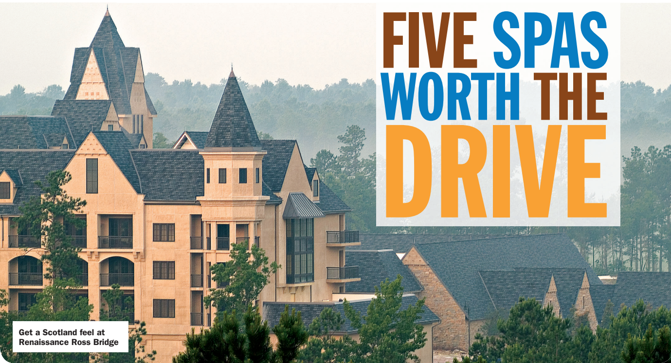
Get a Scotland feel at Renaissance Ross Bridge