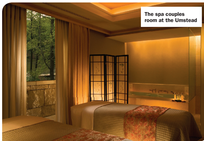
The spa couples room at the Umstead

Amenities: The spa's quiet room, sauna, whirlpool, steam room and plush relaxation lounge invite lingering and offer multiple ways to refresh and renew.