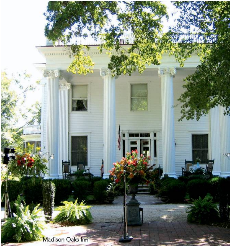
Madison Oaks Inn

smoothies and organic fruit juices. Train Wreck is a burger joint (housed in an old box!) where daily specials range from fried fish to chili cheese dogs. Ye Old Colonial cafeteria-style restaurant has been run by the same family for 50 years. O'Hara's, a relatively new addition to Madison's dining scene, offers an upscale menu that changes daily.