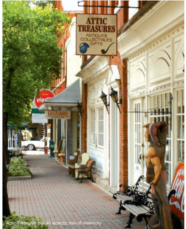
Attic Treasures has an eclectic mix of inventory

Fifteen restaurants offer a wide variety of dining options. The menu at Perk Avenue Café features regular and specialty coffees, soups, sandwiches, wraps, salads and bakery goods. Scoops boasts 16 ice cream flavors and 36 custom mix-ins plus refreshing fruit