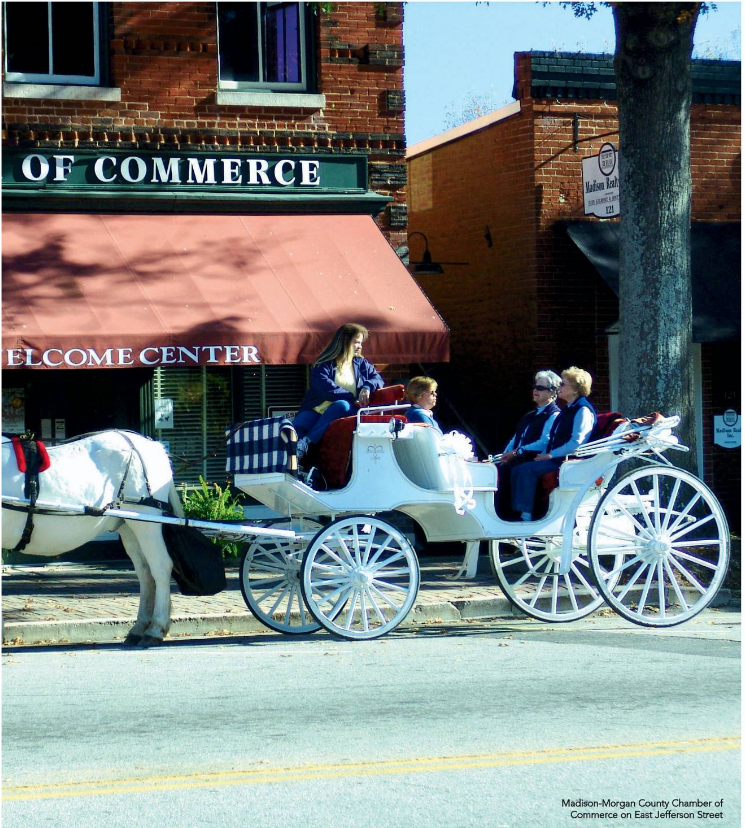
Madison-Morgan County Chamber of Commerce on East Jefferson Street