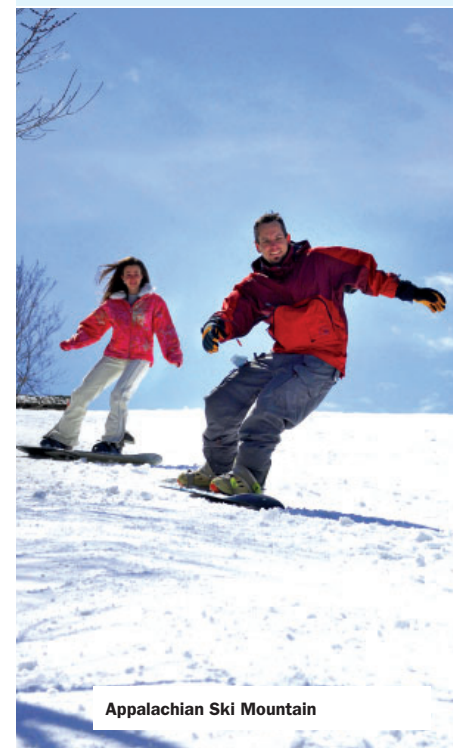
Appalachian Ski Mountain

1167 Main Street Blowing Rock, NC 28605 828-295-7075 www.storiestreetgrille.com