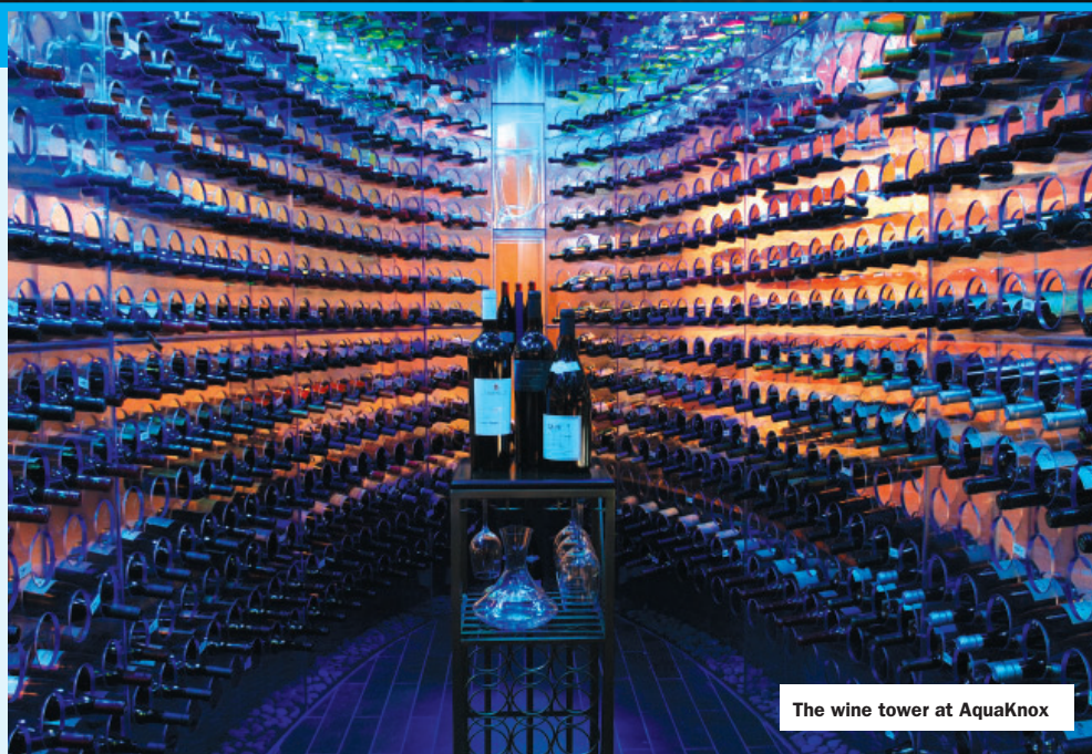
The wine tower at AquaKnox

“The menu sets a new standard of culinary excellence, boasting fresh seafood flown in daily from around the world, including stone crab claws and a superb raw