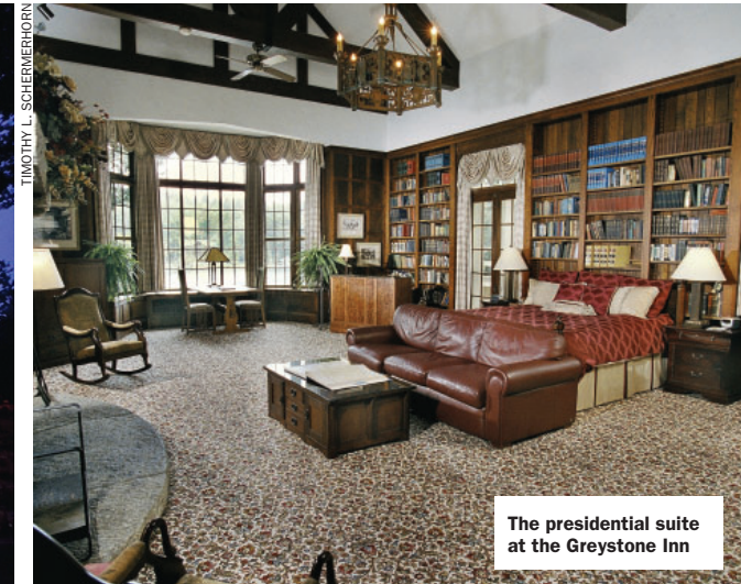
The presidential suite at the Greystone Inn