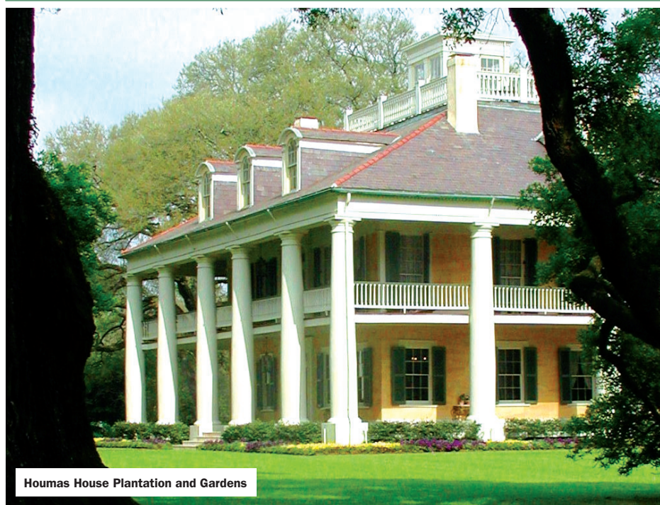
Houmas House Plantation and Gardens