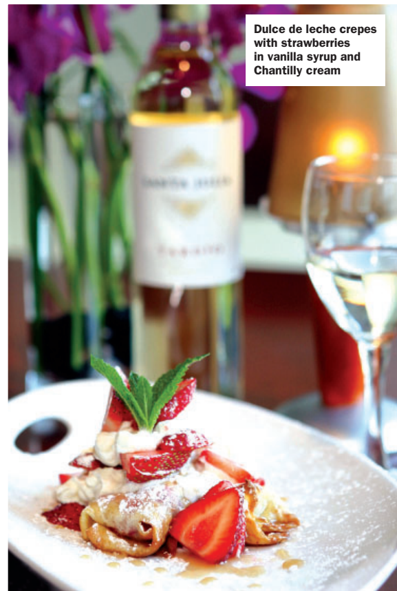
Dulce de leche crepes with strawberries in vanilla syrup and Chantilly cream