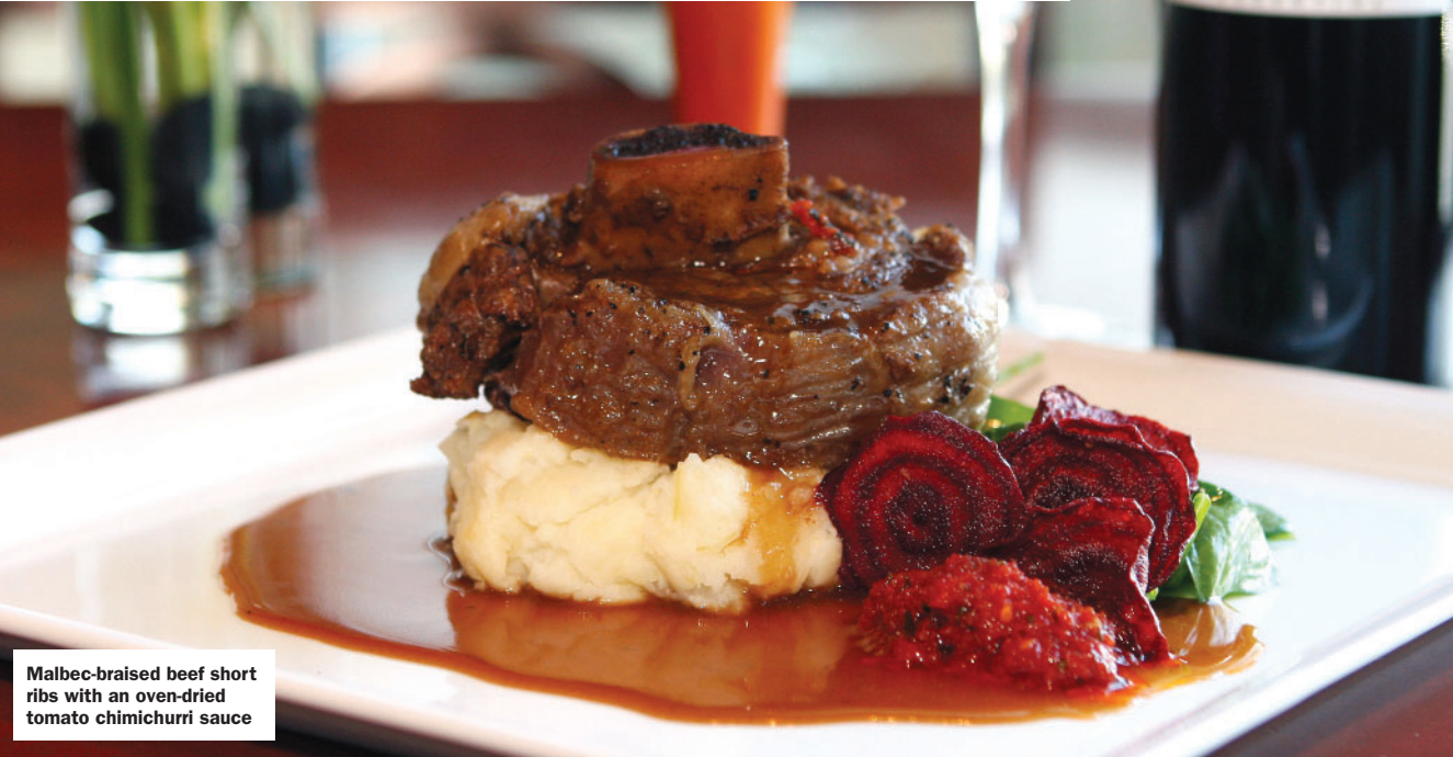
Malbec-braised beef short ribs with an oven-dried tomato chimichurri sauce

Discovering the rich flavors of Argentina at Prime Meridian