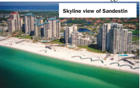
Skyline view of Sandestin

While it's easy to recognize that Sandestin is family-friendly, it may be a less obvious choice for a romantic getaway. But whether you leave the kids at home or take advantage of the certified babysitting program to get a few hours of couple-time, you can find romance at Sandestin. Here are 12 suggestions: