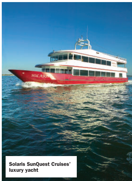
Solaris SunQuest Cruises' luxury yacht

Sandestin Golf & Beach Resort proves a romance-friendly vacation spot (but kids get along fine there, too)