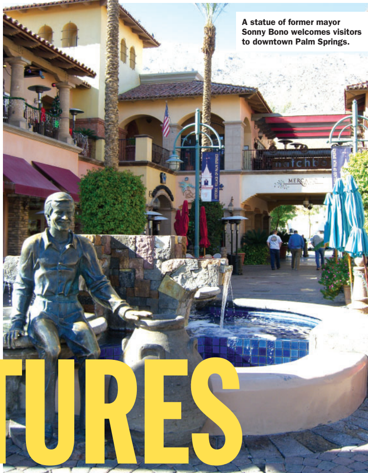
A statue of former mayor Sonny Bono welcomes visitors to downtown Palm Springs.